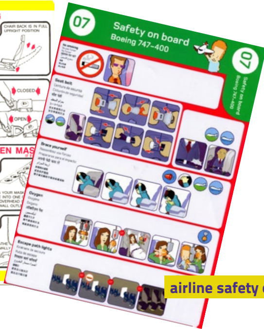
airline safety card